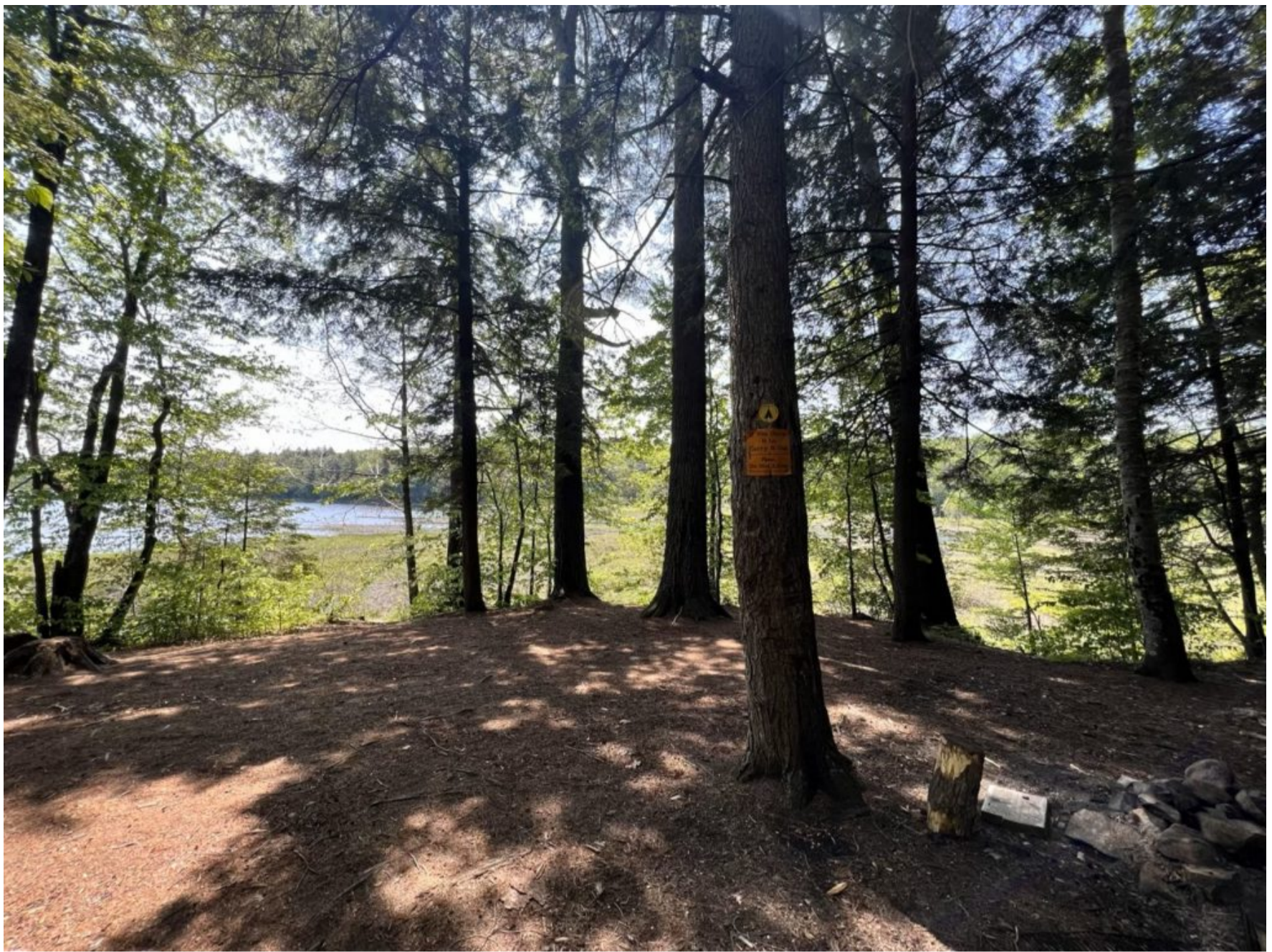
We walked to the lake by following a short path across a stretch of bog to the water's edge. This is a floating bog with noticeable bounce, we'll have to jump on it to see the if the land ripples around us.