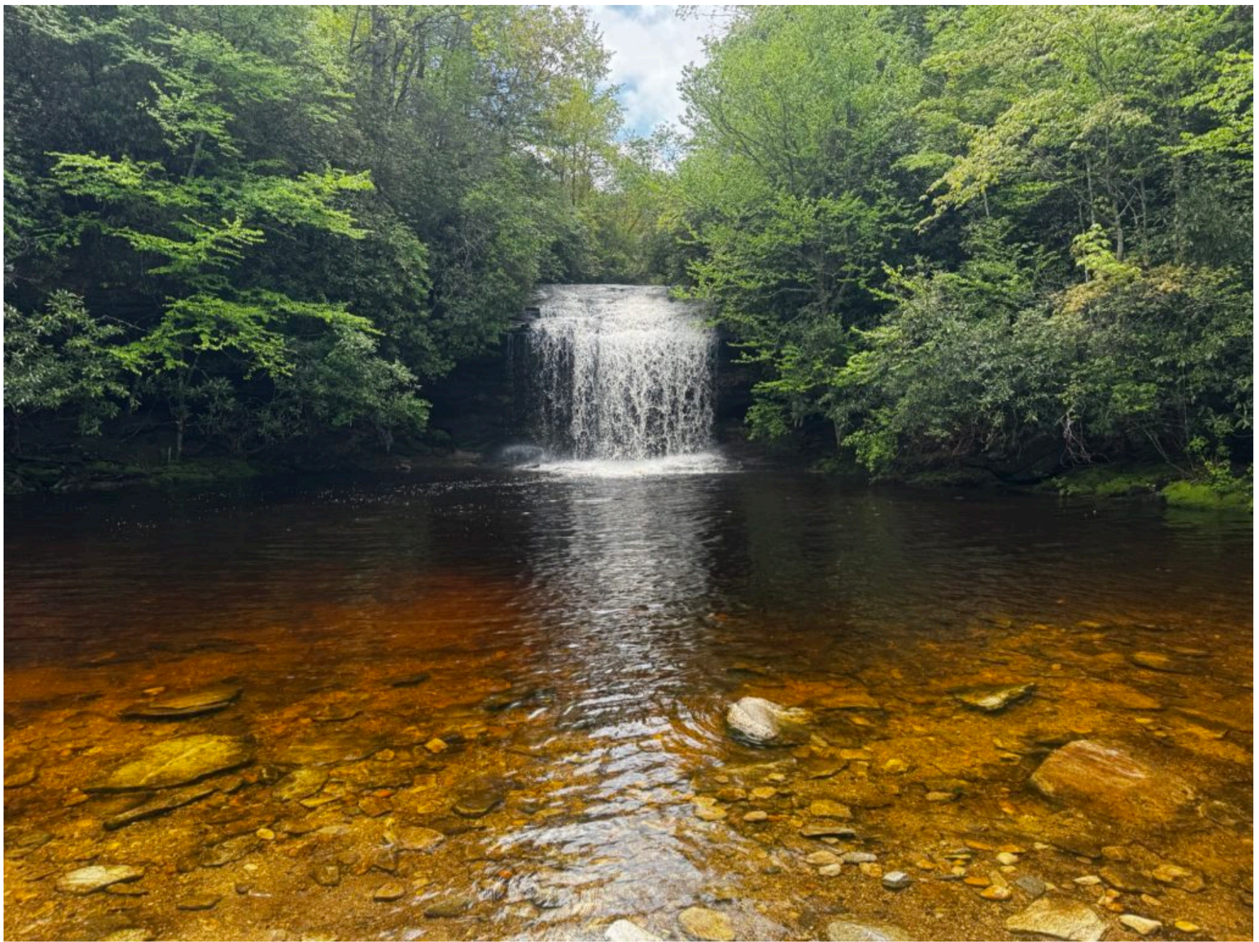
Past Sandbar Pool Beach back up to where we started.