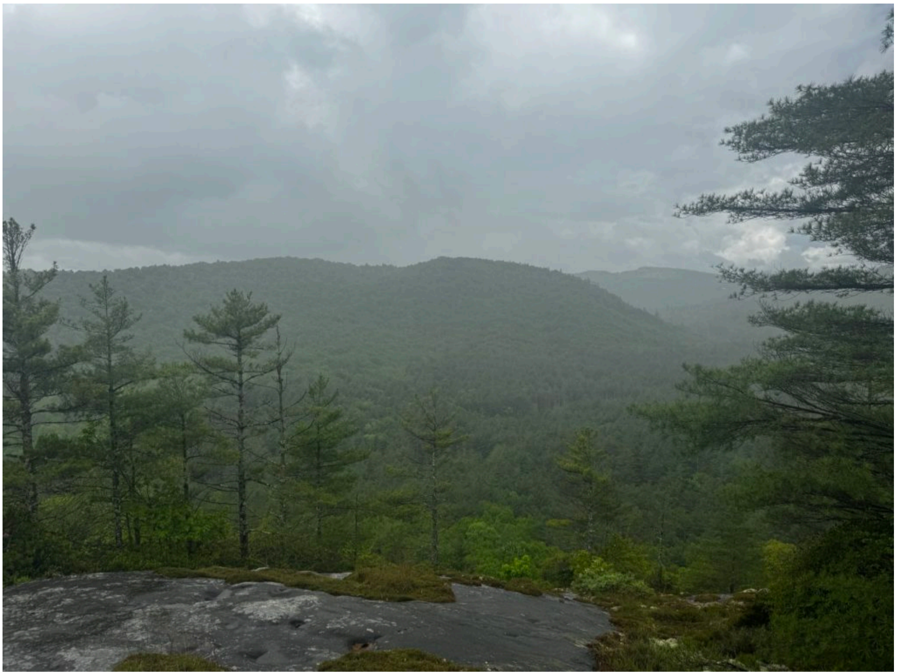
The rain was on us as we passed the campsite on the way.