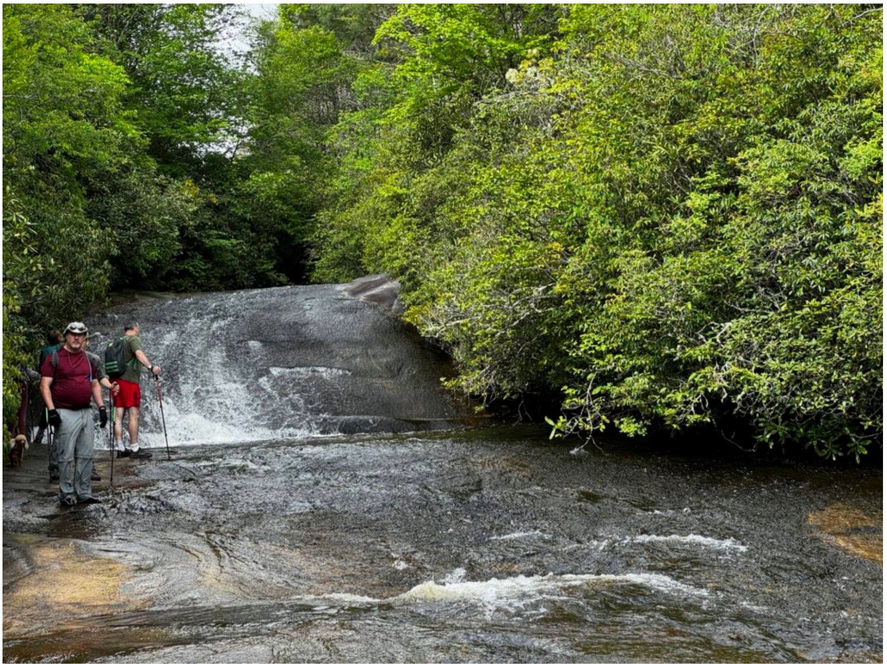
Then hit the Great Wall trail to the (you guessed it) the Great Wall.