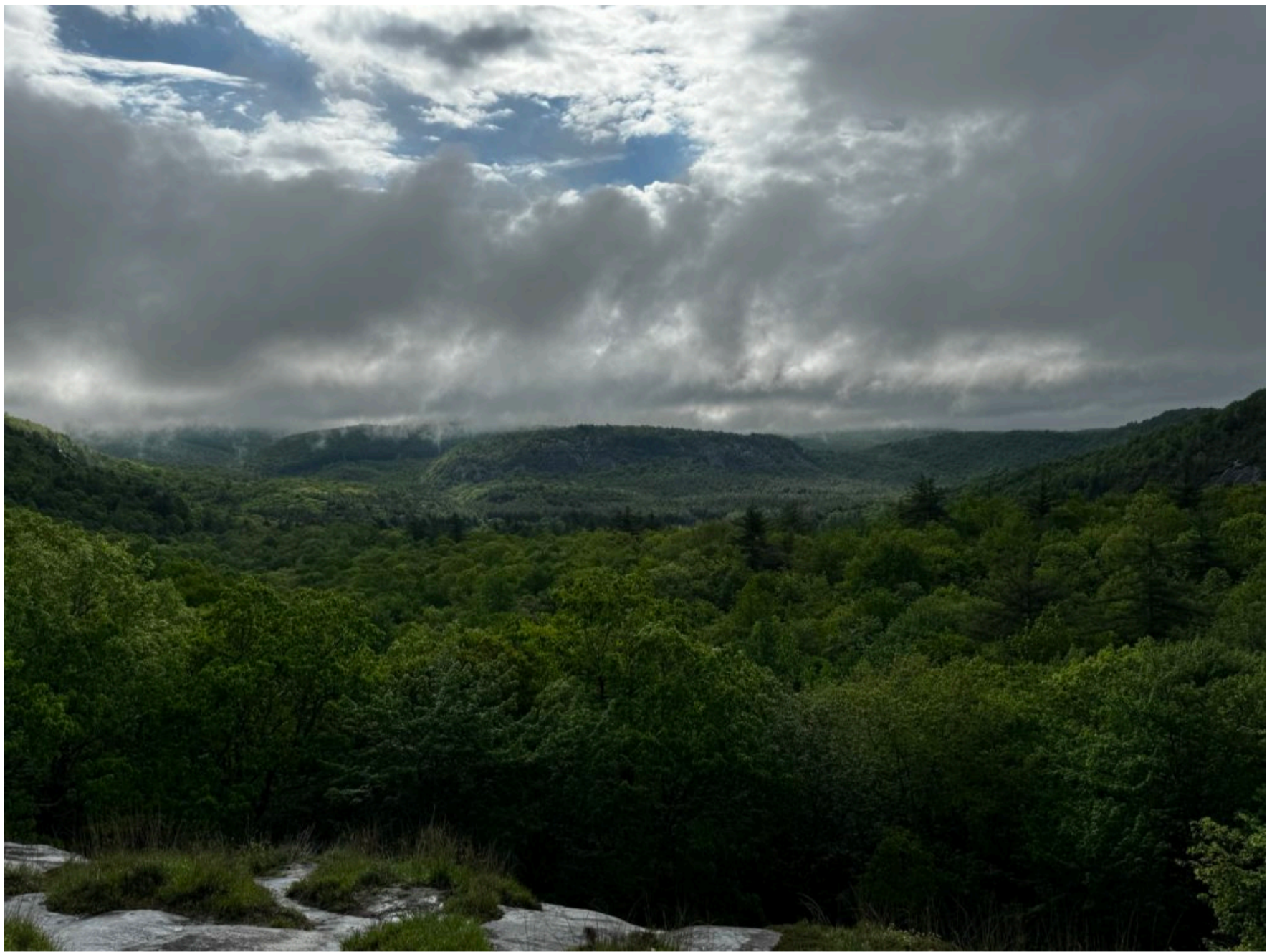
From here we headed down the Wilderness Falls Trail to Wildcat Falls. Frolic town Trail to Frolic town Falls.