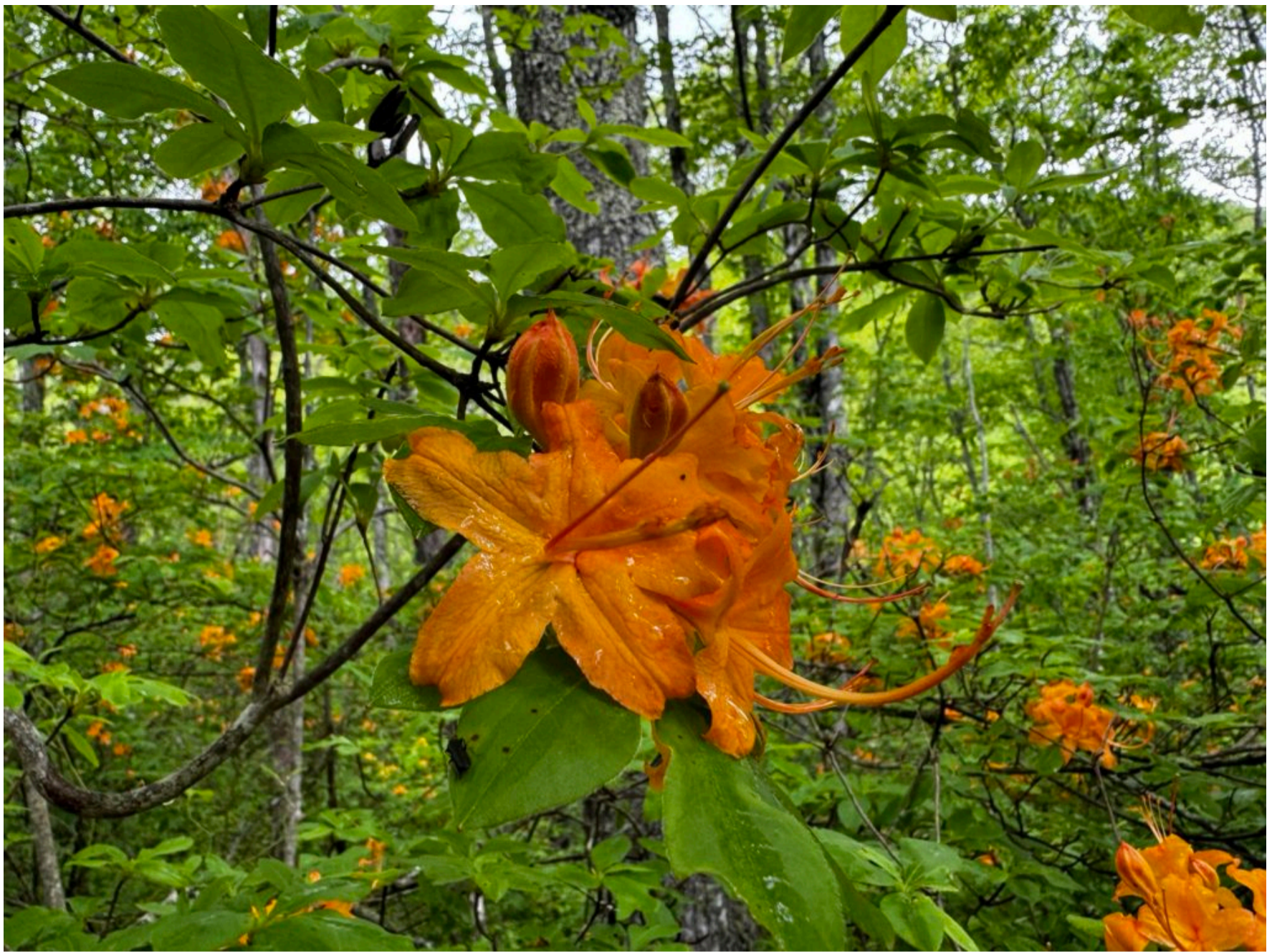
All in all, it was about 10 miles much of it in the rain all of it a very good Hike.