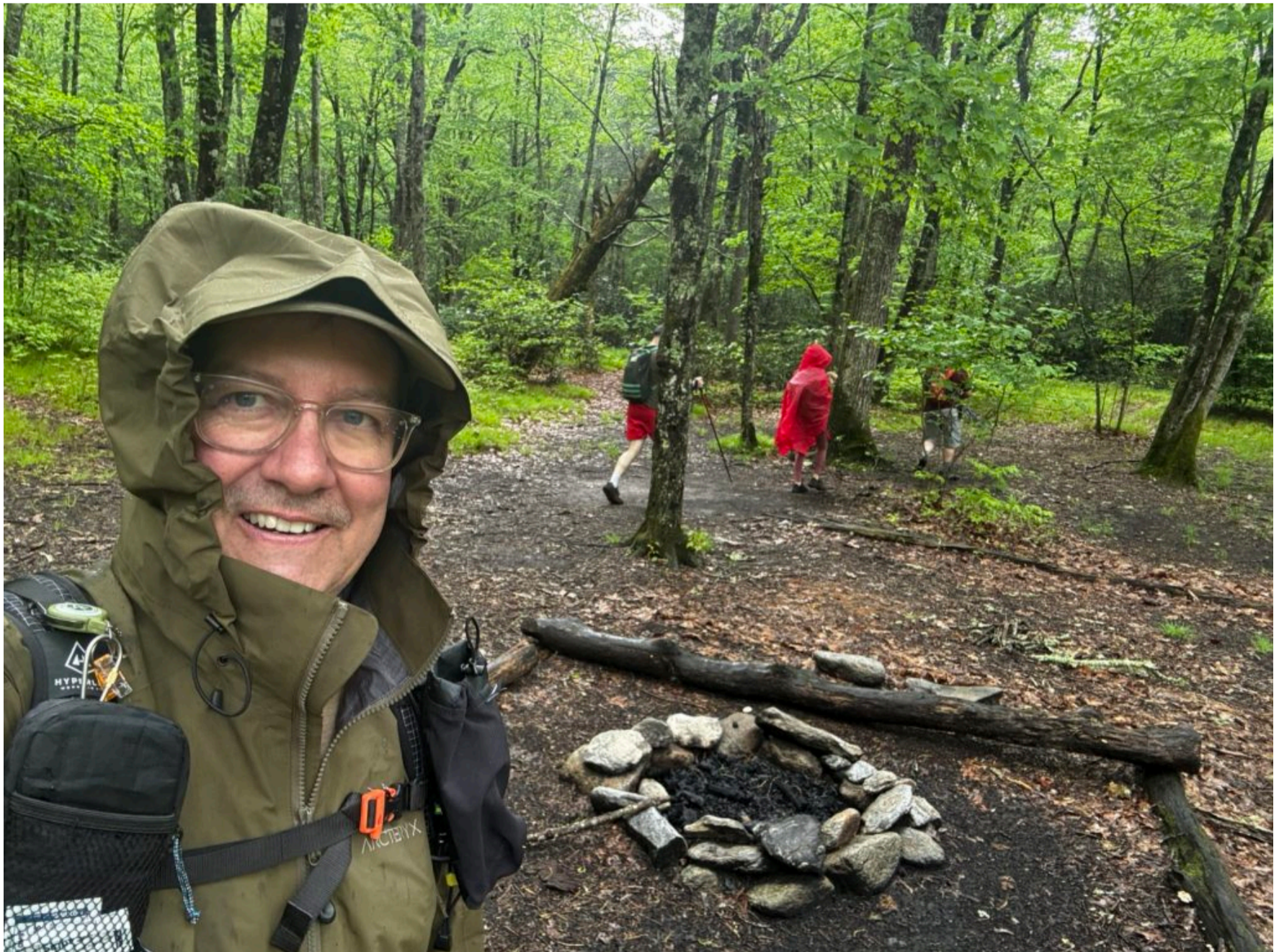
We hightailed it out of there to circle around to the all too familiar, Schoolhouse Falls.