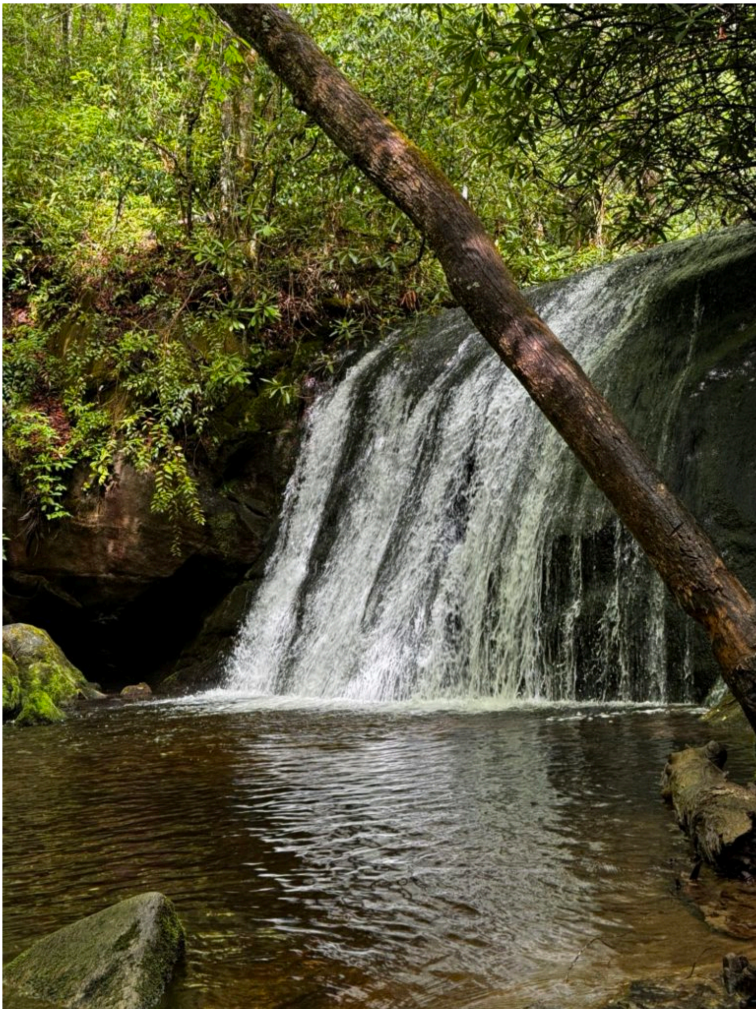
We then proceeded to cross Panther town Creek on our way to Granny Burrow Falls.