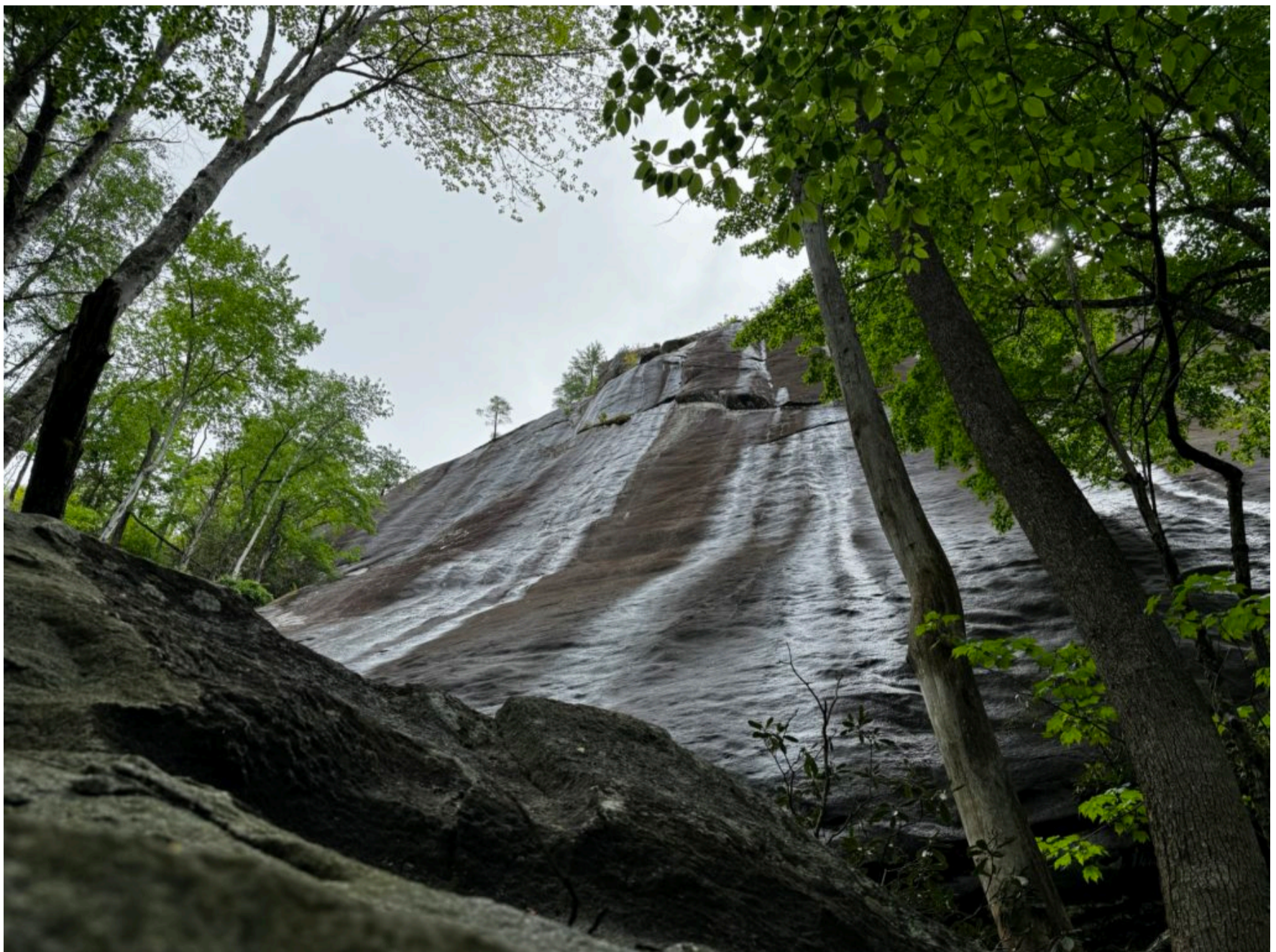
We went along Panthertown Creek Trail, where intersected the Little Green Trial to Tranquility Point.