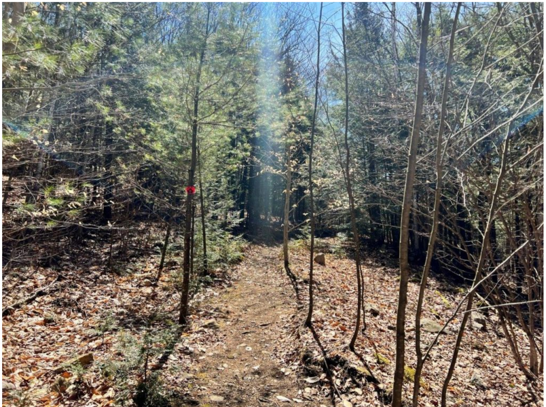
Nature Trail Entrance at Red Marker

It seemed that we came upon the nature trail very quickly. It looked so inviting with a cloudy, blurry or even foggy entrance - we jumped right in!