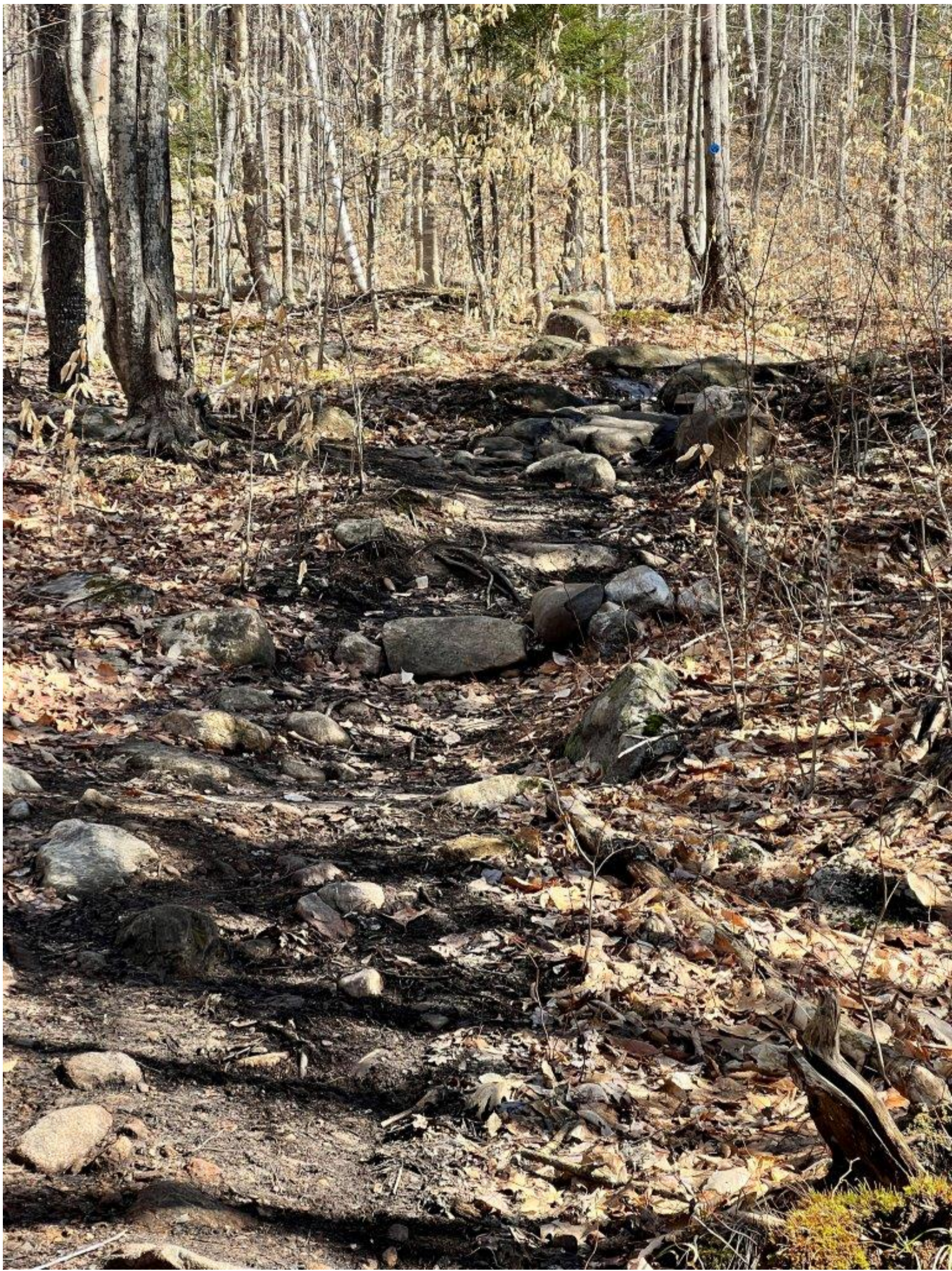
Continuing upward, we chatted, took in the day and had a dry enjoyable journey for about a mile. Then the path started to change from gravel, to rooted, rocky, and then to bolder-ed!