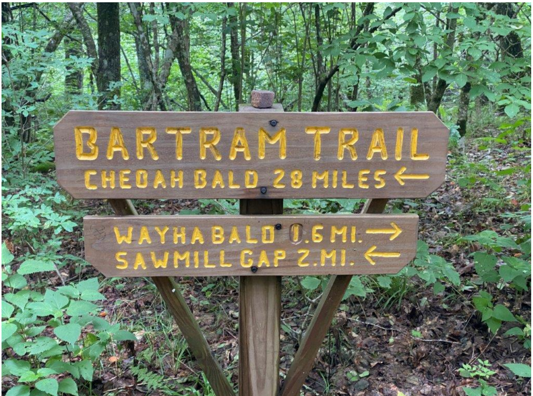
The rest of the way down to sawmill gap enjoy the views. It's easy from here out as it's mostly downhill!