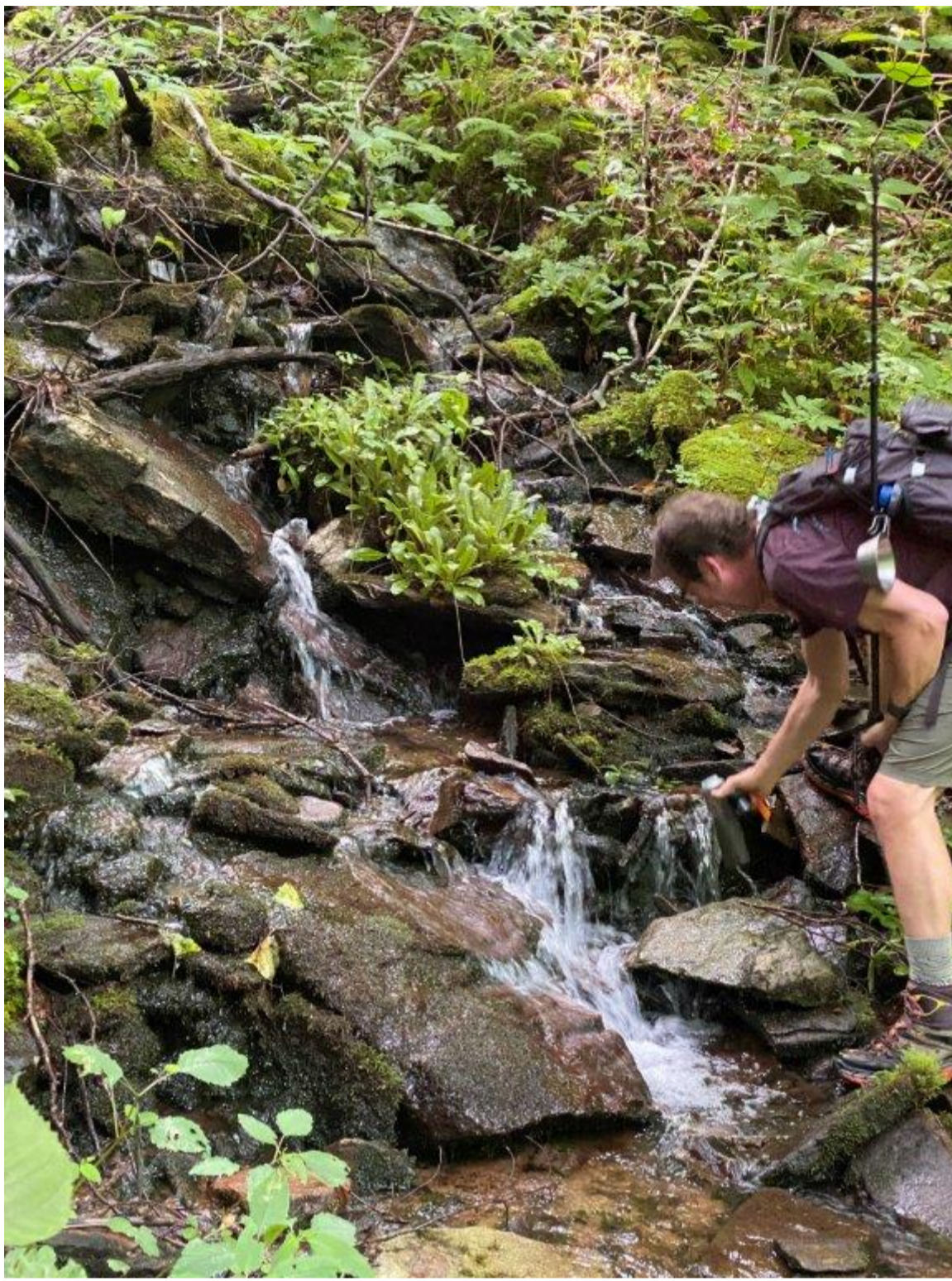
Then right on Bartram trail to return.